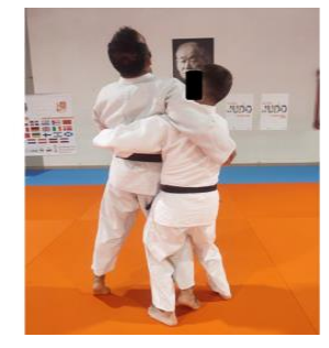
Figure 5. Counterattack