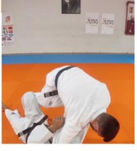
Figure 2. Harai-goshi