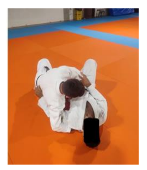
Figure 3. Kosoto-gari/gake