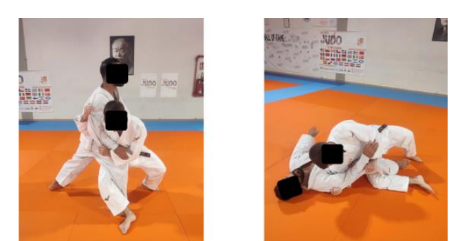
Figure 4. Kouchi-gari/gake

Other examples include counterattacks (18.6%) ( Figure 5 ), attacks (14.0%), and the tai-otoshi technique (11.6%) ( Figure 6 ) being of note [5, 24].