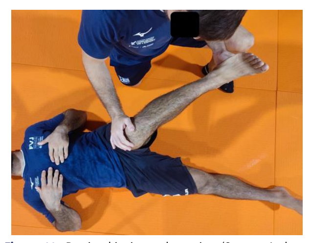
Figure 11. Passive hip internal rotation

distance the knee could be brought towards the wall without the heel being lifted. The point at which the patient's heel was felt to lift indicated the limit of motion at which the measurement was performed [31]. The lunge test has demonstrated good to excellent reliability, with intraclass correlation coefficients (ICC) between 0.80 and 0.96 for the asymptomatic side. On the symptomatic side, the lunge test showed excellent reliability, with ICCs greater than 0.90 [32].