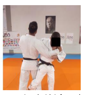
Figure 1. Osoto-gari