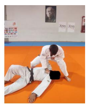
Figure 6. Tai-otoshi