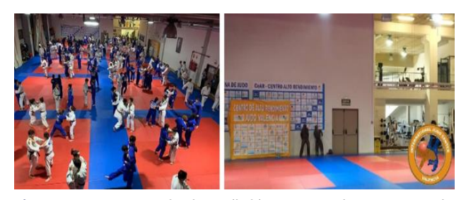
Figure 8. CeAR sport facilities (left) & CeAR judo mat in a judo training (right)

Therefore, the main objective of the present study was to detect the possible existence of differences in movement patterns among elite judokas according to their sex to identify athletes with a higher risk of ACL injury.