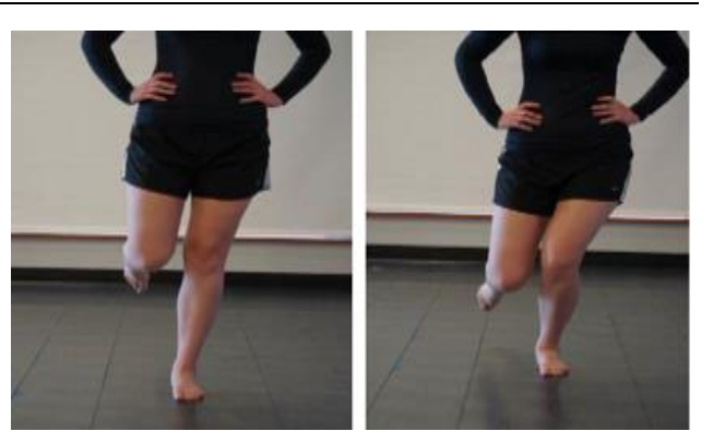
Figure 9. Single leg squat test: First stage of test (left) & Second stage of test (right)

The SLS test was performed as described by Ugalde et al. ( Figure 9 ) [29]. The barefooted athletes were asked to place their hands on their hips, stand on one limb, and flex the opposite limb to 90°. They were then instructed to perform a single leg squat to 30° of knee flexion and return to a fully extended knee position. We checked that the range of motion of the SLS was 30° of knee flexion using the goniometer. SLS was performed thrice in a row on each leg. The investigator noted any abnormal responses that consisted of arms flailing, Trendelenberg, or collapse of the supporting knee into valgus, indicating an abnormal response. We defined a positive SLS