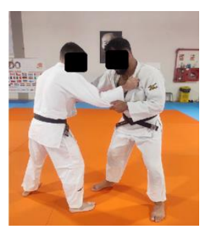
Figure 7. Grip styles: Kenka-yotsu grip style–A judoka & opponent have different grip sides (left) & Ai-yotsu grip style–A judoka & opponent have same grip side

It is speculated that the higher risk of injury in kenka-yotsu is due to a greater likelihood of being counter-attacked, a common condition of ACL tears [3, 24].